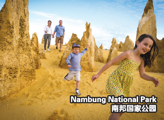
Nambung National Park 南邦国家公园