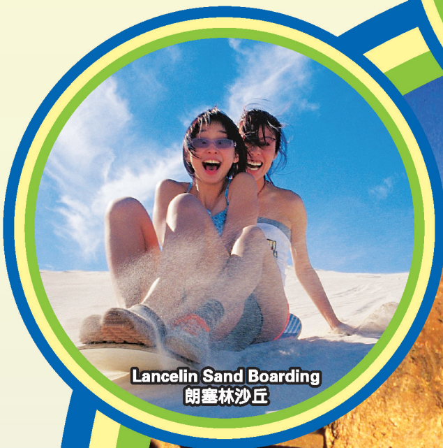
Lancelin Sand Boarding 朗塞林沙丘