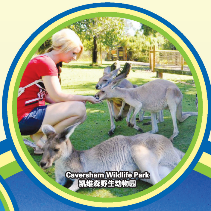
Caversham Wildlife Park 凯维森野生动物园