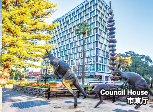
Council House 市政厅