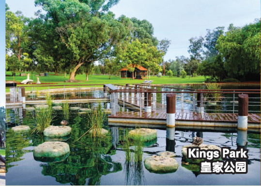
Kings Park 皇家公园