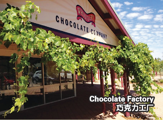
Chocolate Factory 巧克力工厂