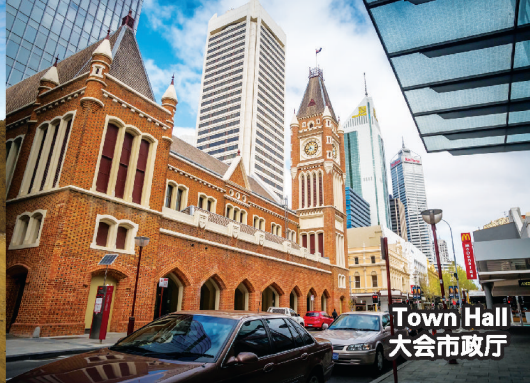
Town Hall 大会市政厅