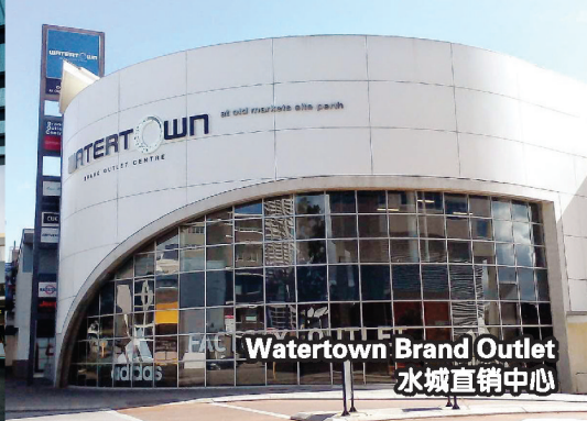
Watertown Brand Outlet 水城直销中心