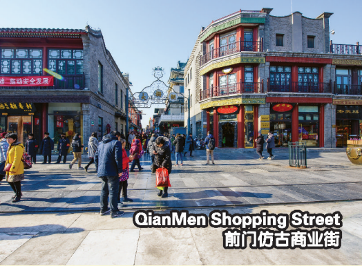
QianMen Shopping Street 前门仿古商业街