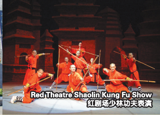
Red Theatre Shaolin Kung Fu Show 红剧场少林功夫表演