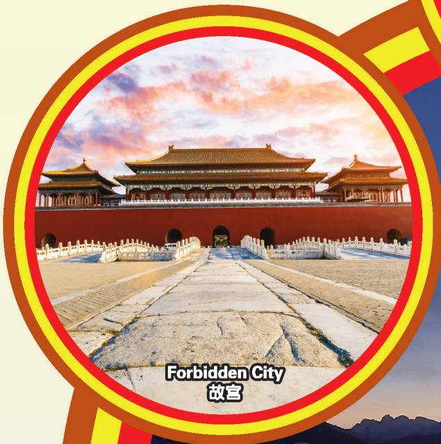
Forbidden City 故宫