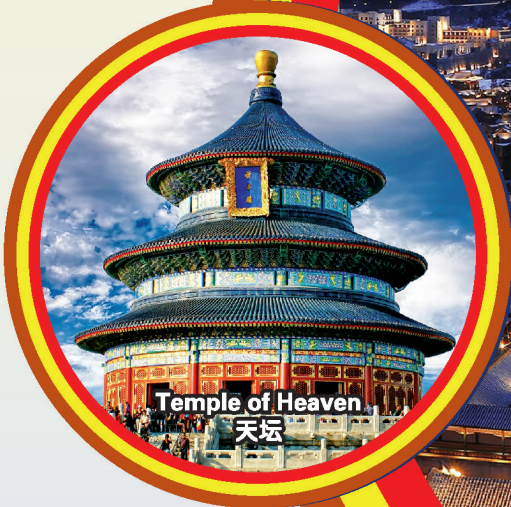
Temple of Heaven 天坛