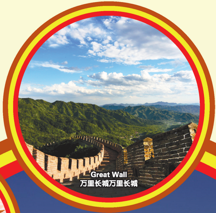
Great Wall 万里长城万里长城