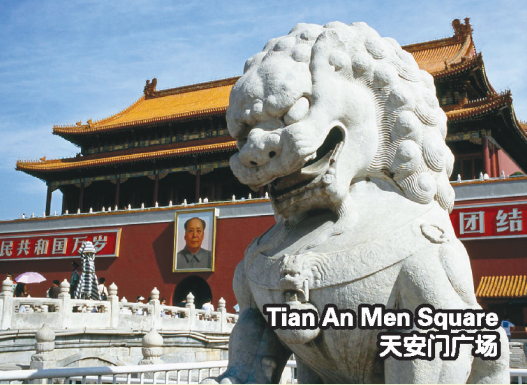
Tian An Men Square 天安门广场