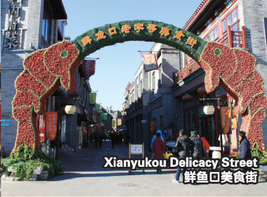
Xianyukou Delicacy Street 鲜鱼口美食街