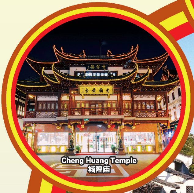
Cheng Huang Temple 城隍庙