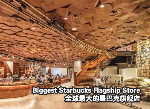
Biggest Starbucks Flagship Store 全球最大的星巴克旗舰店