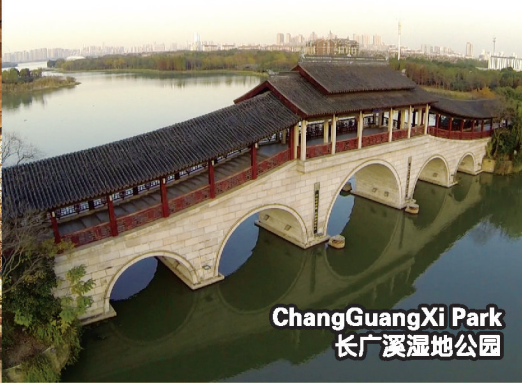
ChangGuangXi Park 长广溪湿地公园