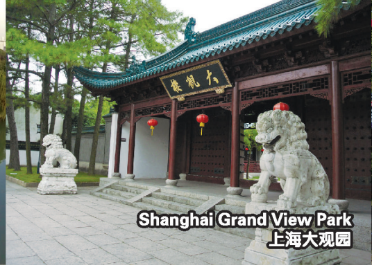
Shanghai Grand View Park 上海大观园