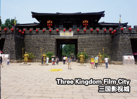
Three Kingdom Film City 三国影视城