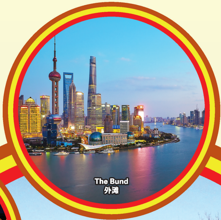
The Bund 外滩