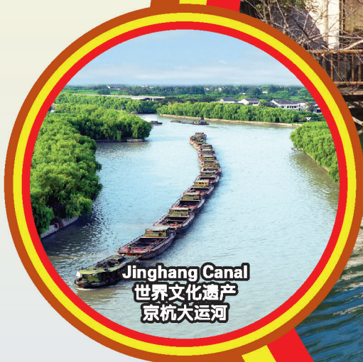
Jingshan Canal 世界文化遗产 京杭大运河

行程次序，以当地旅社安排为准。 Sequences of itinerary are subject to local arrangement.