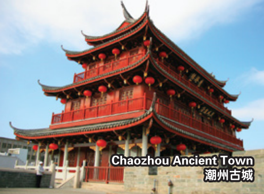
Chaozhou/Ancient Town 潮州古城