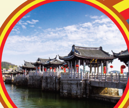
Xiangzi Bridge 湘子桥