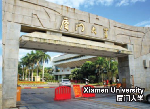
Xiamen University 厦门大学