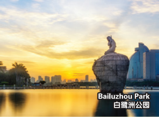
Bailuzhou Park 白鹭洲公园