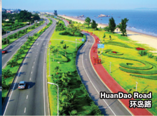
HuanDao Road 环岛路