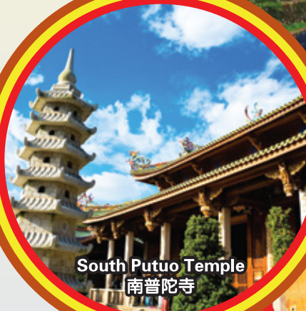
South Putuo Temple 南普陀寺

行程次序，以当地旅社安排为准。 Sequences of Itinerary are subject to local arrangement.