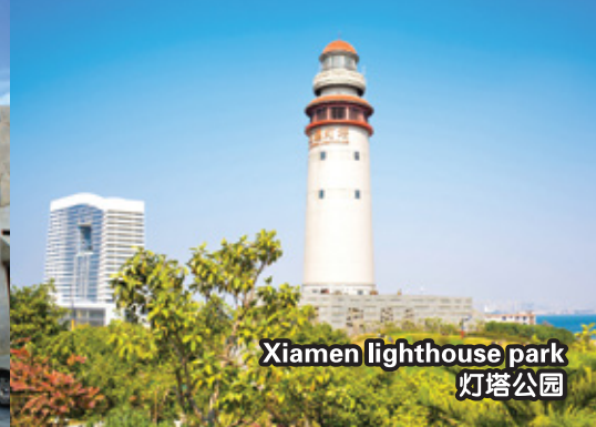
Xiamen lighthouse park 灯塔公园