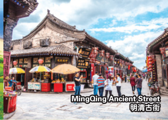
MingQing Ancient Street 明清古街