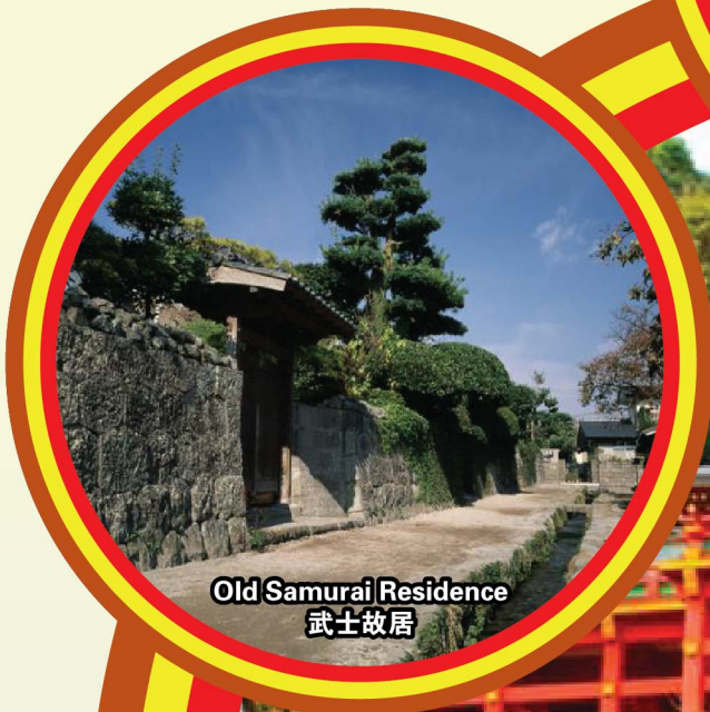
Old Samurai Residence 武士故居