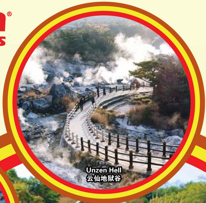
Unzen Hell 云仙地狱谷