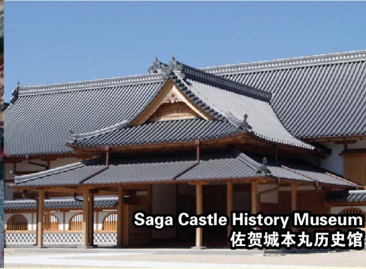
Saga Castle History Museum 佐贺城本丸历史馆