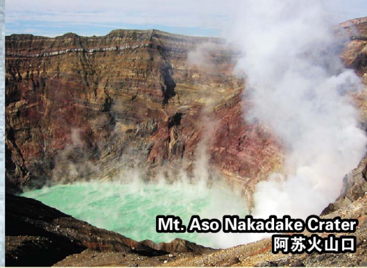
Mt. Aso Nakadake Crater 阿苏火山口