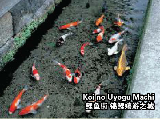
Koi no Uyogu Machi 鲤鱼街 锦鲤嬉游之城