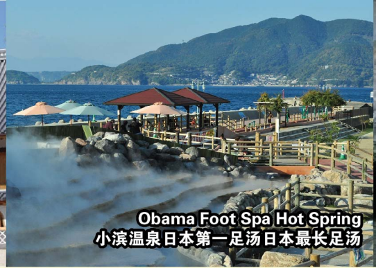
Obama Foot Spa Hot Spring 小滨温泉日本第一足汤日本最长足汤