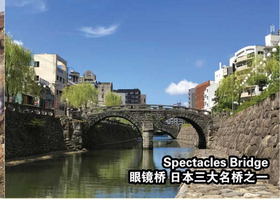
Spectacles Bridge 眼镜桥 日本三大名桥之一