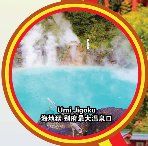
Umi Jigoku 海地狱 别府最大温泉口