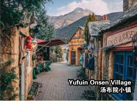
Yufuin Onsen Village 汤布院小镇