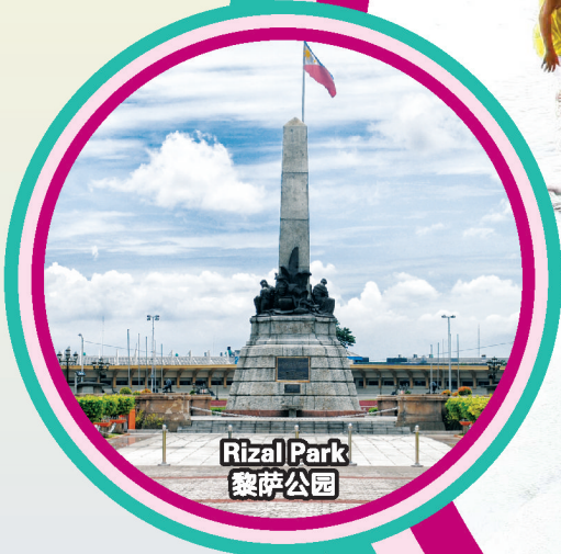
Rizal Park 黎萨公园