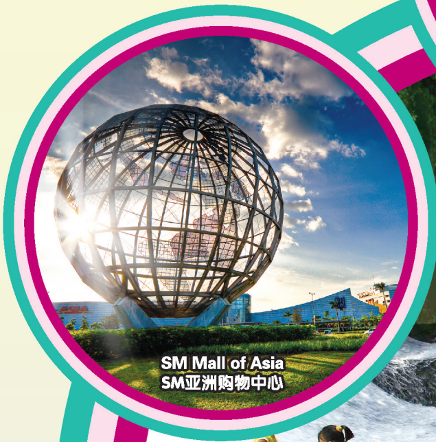
SM Mall of Asia SM亚洲购物中心