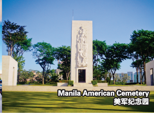
Manila American Cemetery 美军纪念园