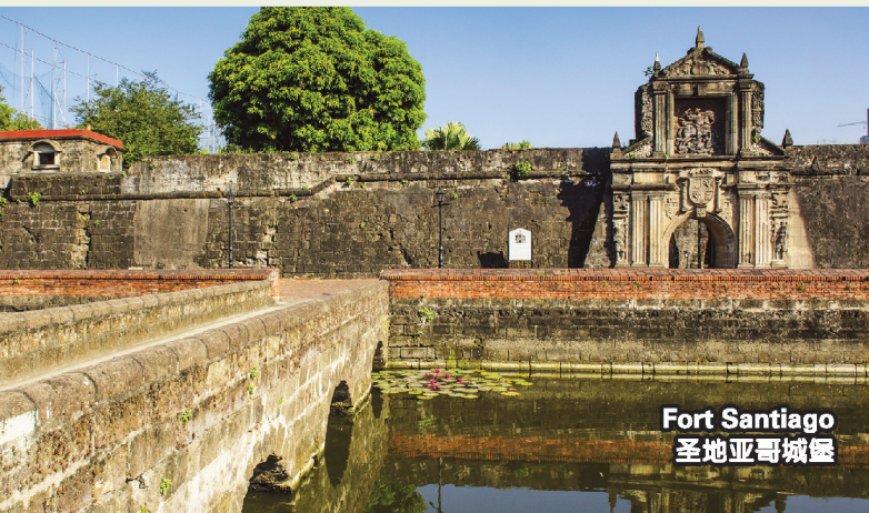
Fort Santiago 圣地亚哥城堡