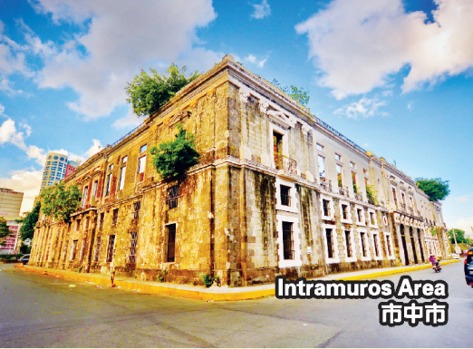
Intramuros Area 台中市