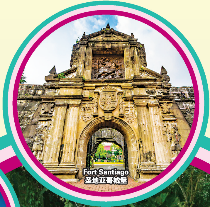
Fort Santiago 圣地亚哥城堡