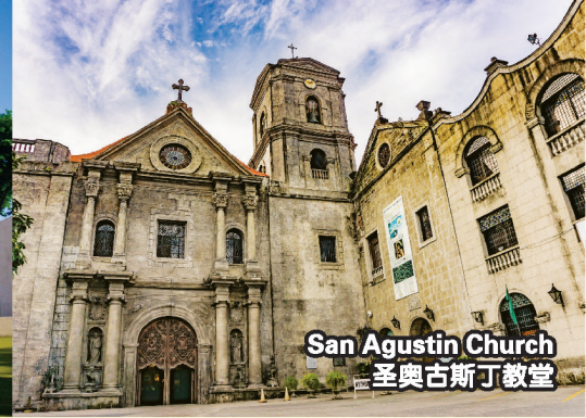
San Agustin Church 圣奥古斯丁教堂