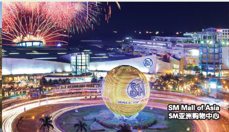
SM Mall of Asia SM亚洲购物中心